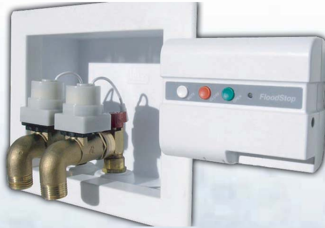
Save space with FloodStops angled motorized ball valves.

Automatically shut off the water supply to appliances whenever they start to leak.