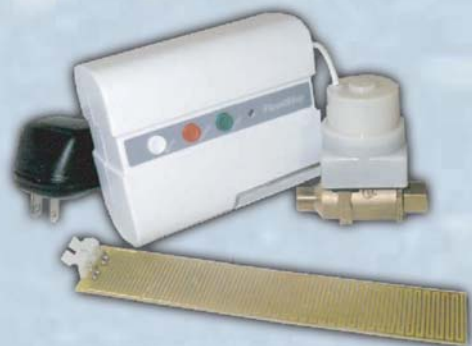
FS3/8C - Dish Washers and Toilets FS1/4C - Ice Makers and Water Filters