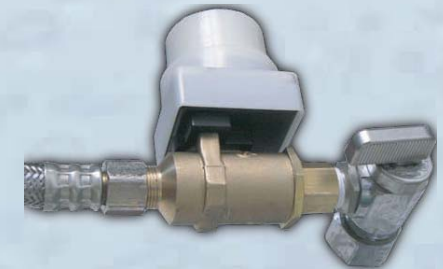
Automatically shut off your dishwasher, toilet or icemaker with our mini ball valves with 3/8" and 1/4" compression fittings.

Power with AC and / or 4 C-size batteries