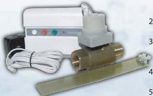
FS3/4NPT- Water Heaters FS125NPT - Water Heaters