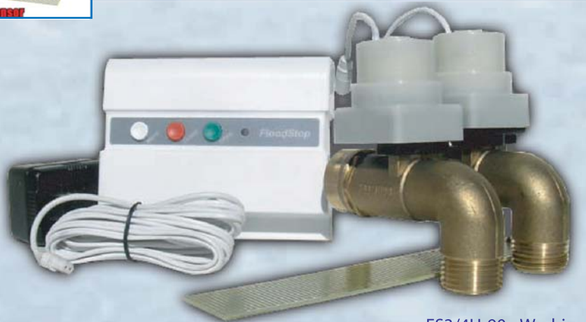
FS3/4H-90 - Washing Machines