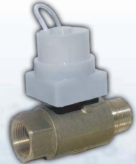
UPC approved valves are Full-Port and offer zero flow restriction!